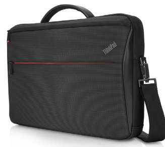
ThinkPad 14-inch Professional Slim Topload