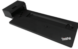
ThinkPad® Pro Docking Station