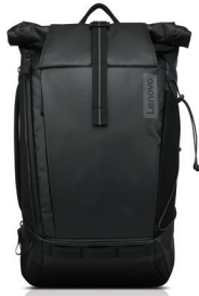
Lenovo 15.6" Commuter Backpack