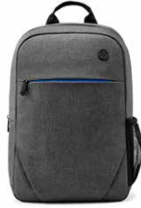
HP Prelude Backpack