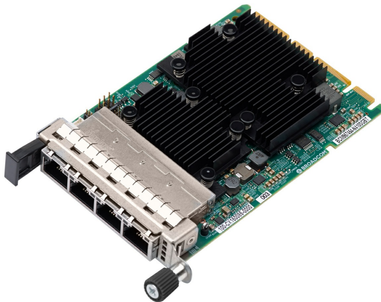
Figure 1. ThinkSystem Broadcom 57454 10GBASE-T 4-port OCP Ethernet Adapter

The following figure shows the 4-port OCP adapter.