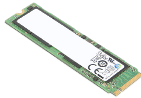
2TB Performance PCIe Gen4 NVMe OPAL2 M.2 2280 SSD