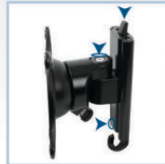
Security lock and screws to enhance stability