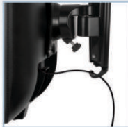
Cable management design