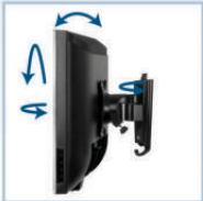
Adjustable screen angle - 360° Rotation; 60° Swivel; ±15° Tilt

Monitor mount x 1 / Wall mount x 1 / M4 (12mm) x 4 / M4 (30mm) x 4 / M5 (12mm) x 4 / M5 (30mm) x 4 / Allen wrench (3mm) x 1 / Allen wrench (4mm) x 1 / Wood screw (Ø6 x 50mm) x 2 / Plastic peg x 2 / Spacer x 4 / User Guide x 1