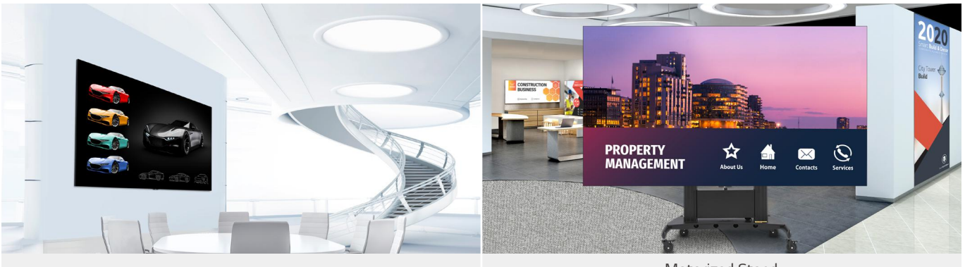
Flight Case & Landscape Wall Mount