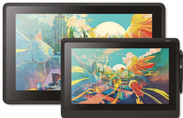
Featured products: Wacom Cintiq 16" and Wacom Cintiq 22" Featured artist: Shan Jiang

Wacom Cintiq is a new class of creative pen display with an optimized feature set for aspiring creatives. Vibrant color, HD clarity and ergonomic design together with the super-responsive Pro Pen 2, offer a truly natural experience and help take your creative ideas and illustrations to the next level.