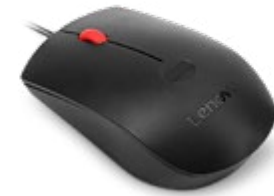
Lenovo Fingerprint Biometric USB Mouse (PN: 4Y50Q64661)

Remote video collaborations are a breeze with Lenovo FHD Webcam. Thanks to its 1080P 2 Megapixel CMOS camera, every video call feels like in-person meetings. Integrated full stereo dual-mics that are built for remote conferencing render crystal-clear audio to your listeners, so every word is heard loud and clear, no matter where they are.