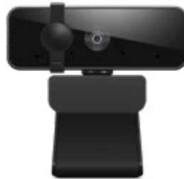
Lenovo FHD Webcam (PN: 4XC1B34802)

An on-ear business-ready stereo USB Headset with a rotatable boom microphone and passive noise cancellation—it is perfect for calls and remote collaboration. Its memory foam and leather earcups make it light and comfortable enough to wear and use all day. 30mm drivers with neodymium magnets deliver excellent audio, while its adjustable headband and boom mic allow either left-side or right-side wearing.