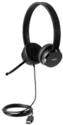
Lenovo 100 Stereo USB Headset (PN: 4XD0X88524)

An on-ear business-ready stereo USB Headset with a rotatable boom microphone and passive noise cancellation—it is perfect for calls and remote collaboration. Its memory foam and leather earcups make it light and comfortable enough to wear and use all day. 30mm drivers with neodymium magnets deliver excellent audio, while its adjustable headband and boom mic allow either left-side or right-side wearing.