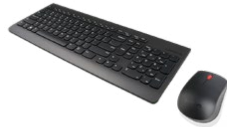
Lenovo Essential Wireless Keyboard and Mouse Combo (PN: 4X30M39458 - 4X30M39507)

Lenovo Fingerprint Biometric USB Mouse offers superb input functionality with an integrated fingerprint sensor for password-free authentication. It features 1600 DPI resolution with an optical sensor for precise tracking and an ambidextrous design for more fluid control and ergonomics. Log-in to Windows instantaneously with one-touch biometric verification