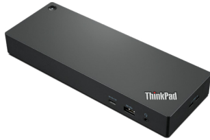
ThinkPad® Universal Thunderbolt™ 4 Dock