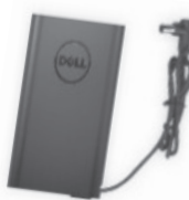
Dell Portable Power Companion (18000 mAh) - PW7015L