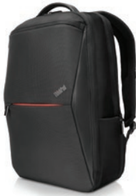
ThinkPad® Professional 15.6" Backpack