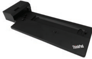
ThinkPad Pro Docking Station