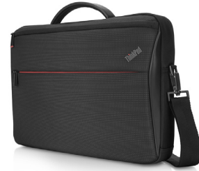
ThinkPad 14-inch Professional Slim Topload