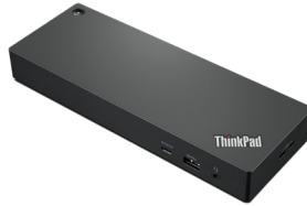
ThinkPad Universal Thunderbolt™ 4 Dock