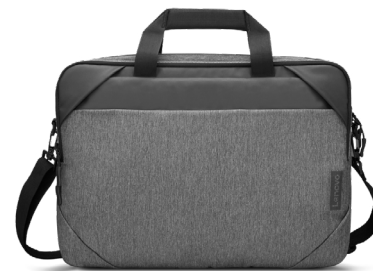
Lenovo Business Casual 15.6-inch Topload